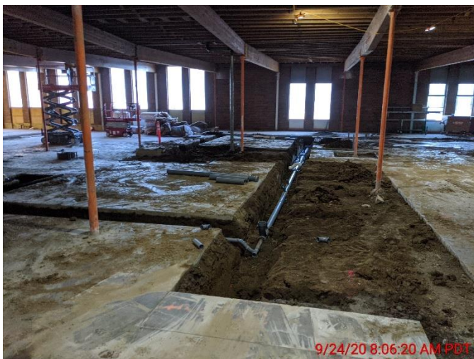
Sector B under slab utility install