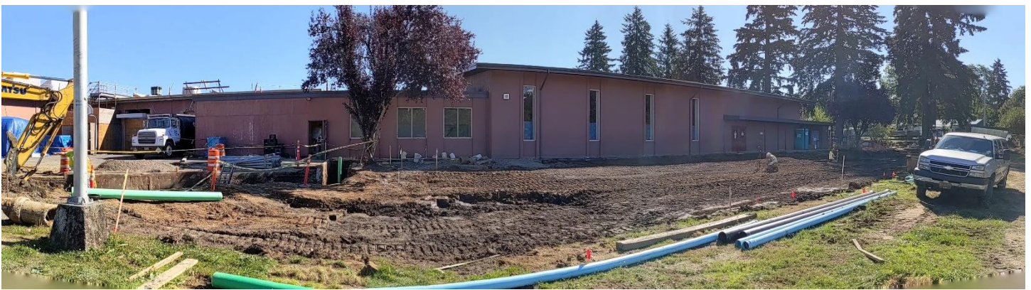
Excavation and Utility Install on West side of School