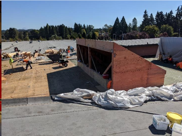
Framing of new Roof Monitors