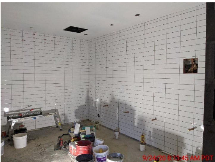
Ceramic Tile being Install in Boys Locker Room