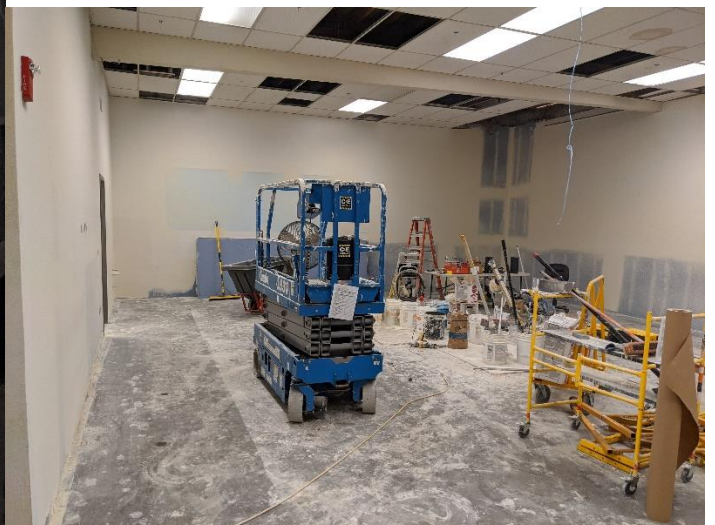
Wall Patching and paint in new Band Room