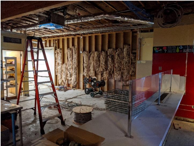
Kitchen Demo for Phase II (removal of walk in freezer)