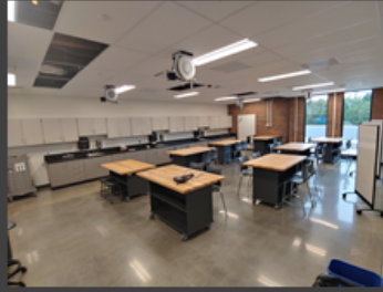
Exploratory Lab finished and ready