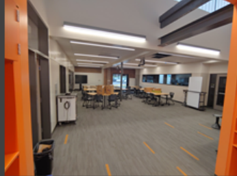
Learning Neighborhood getting outfitted