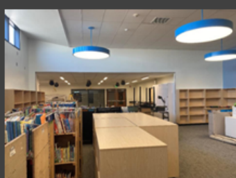
Books being prepared to be shelved at GLES Library