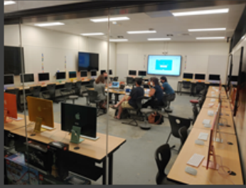
Computer Lab at TMS