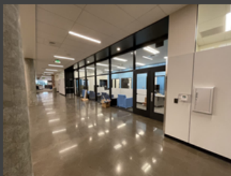
GMS Student Support Center