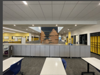
2 nd Floor Learning Neighborhood