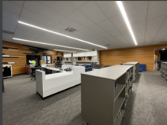
GMS Active Learning Center getting outfitted