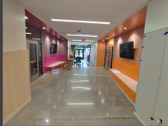
Learning Neighborhood cleaning and prep for school