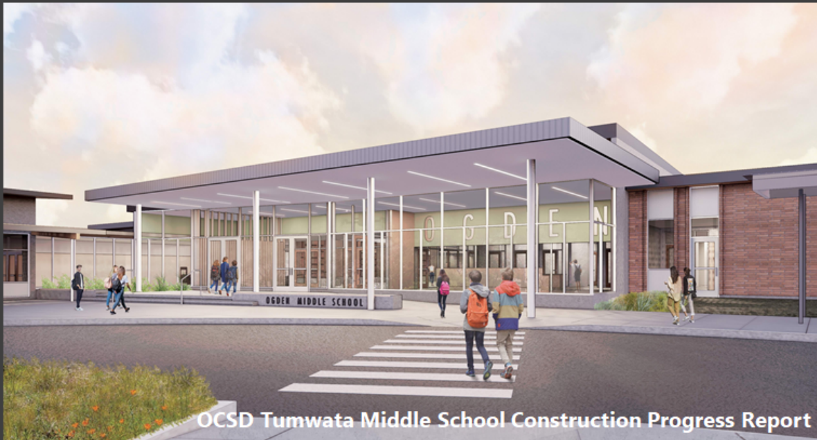
OCSD Tumwata Middle School Construction Progress Report

OCSD Construction Update September 14, 2021