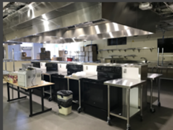
Culinary Arts space getting outfitted