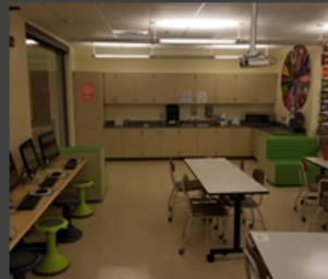
College and Career Classroom complete