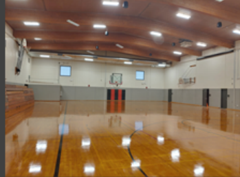
Floors refinished at the Large Gym

OCSD Construction Update September 14, 2021