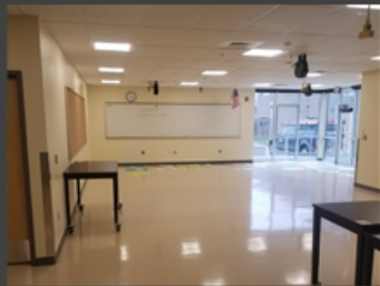
Health Sciences Classroom complete