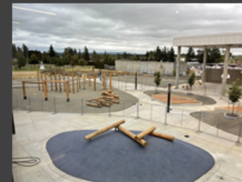
View of the East Courtyard