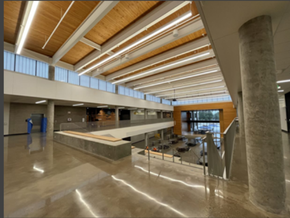
View of the East Courtyard play equipment & covered area

OCSD Construction Update September 14, 2021