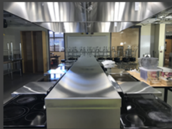
Culinary Arts Classroom – view to corridor