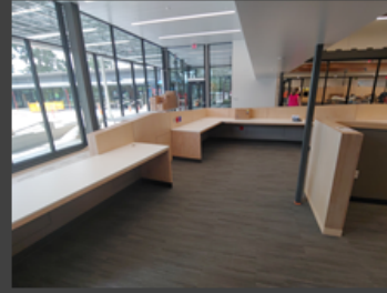
TMS Welcome Center