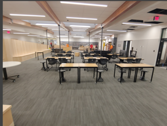
FF&E Move in at the TMS Hub

OCSD Construction Update September 14, 2021