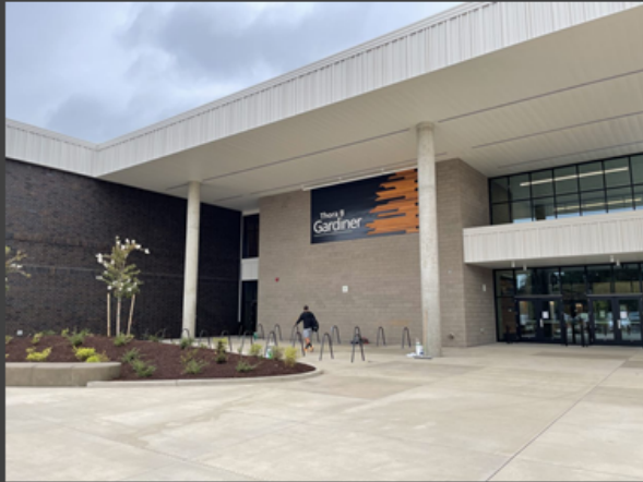
Welcome to Thora B. Gardiner Middle School!!