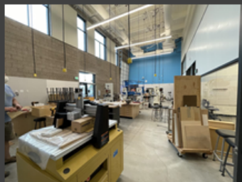
Fabrication lab getting set up