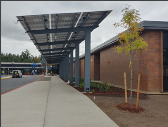
Solar Panel Covered Walkway and final landscaping At Tumwata Middle School

OCSD Construction Update September 14, 2021