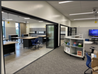
Learning Neighborhood Ready for School!