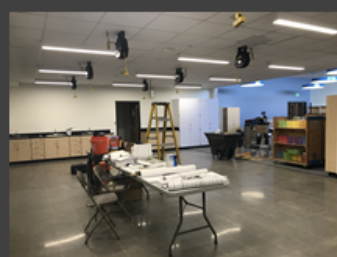
GLES Maker Space getting finished and cleaned